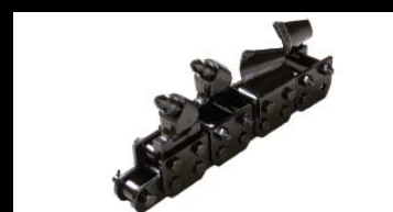
50/50 BULLET TOOTH CHAIN