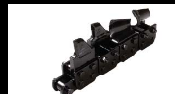
50/50 SHARK TOOTH CHAIN