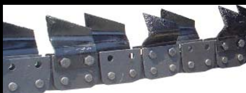
DOUBLE STANDARD CHAIN