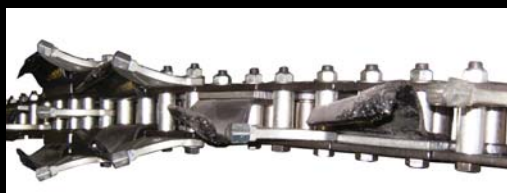
70/30 SCORPION CHAIN